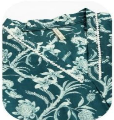
SET0075 (1 KURTI, 1 PANT) FABRIC: COTTON