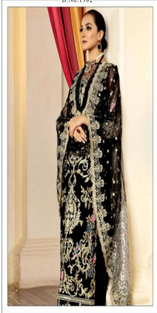
TOP- FOX GEORGETTE WITH EMBROIDERY WORK BOTTOM+INNER - HEAVY SHANTUN DUPATTA - NAZNIN EMBROIDERY WORK