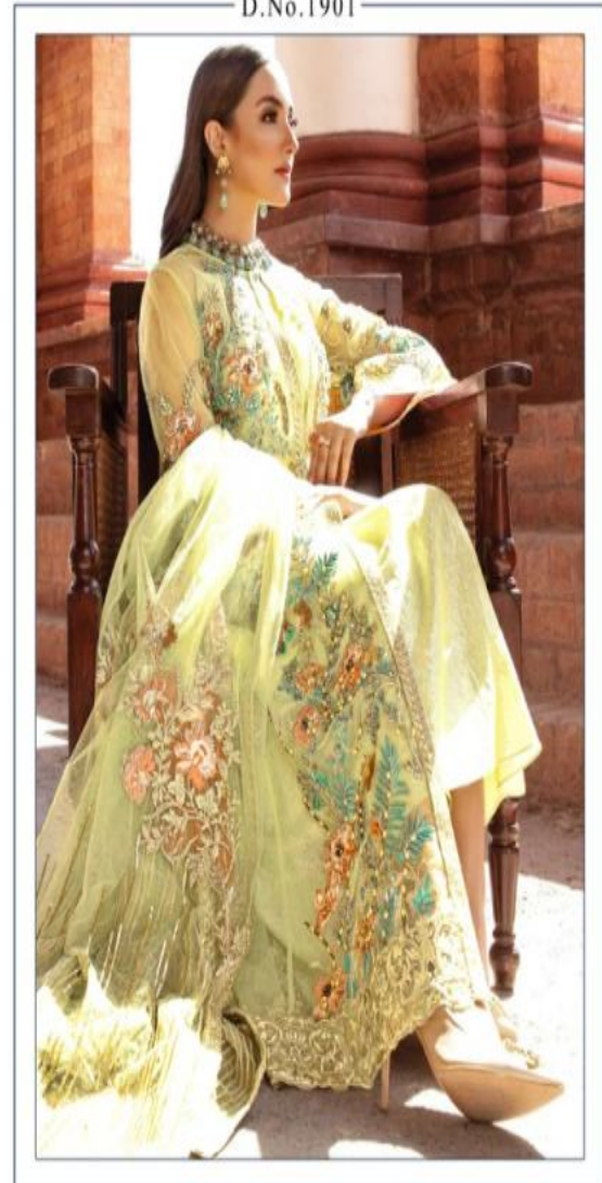
TOP- FOX GEORGETTE WITH EMBROIDERY WORK BOTTOM+INNER - HEAVY SHANTUN DUPATTA - HEAVY NET WITH EMBROIDERY WITH PATCH