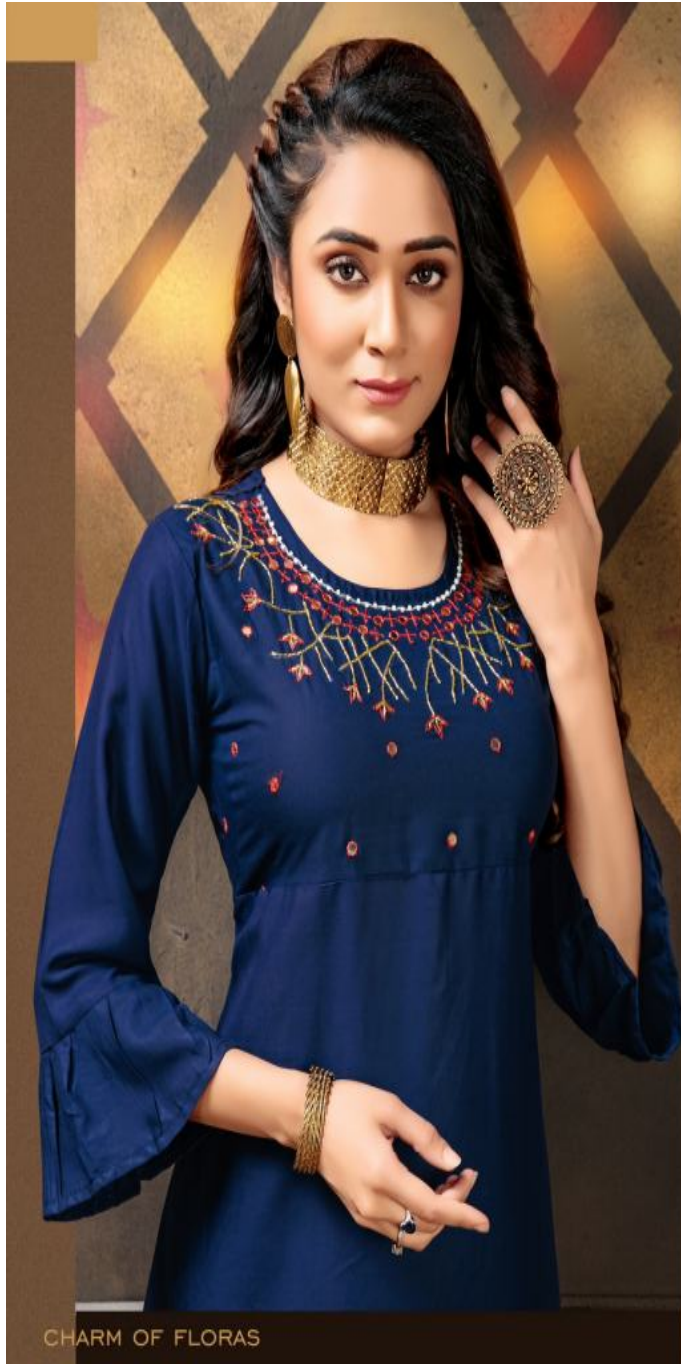
CHARM OF FLORAS