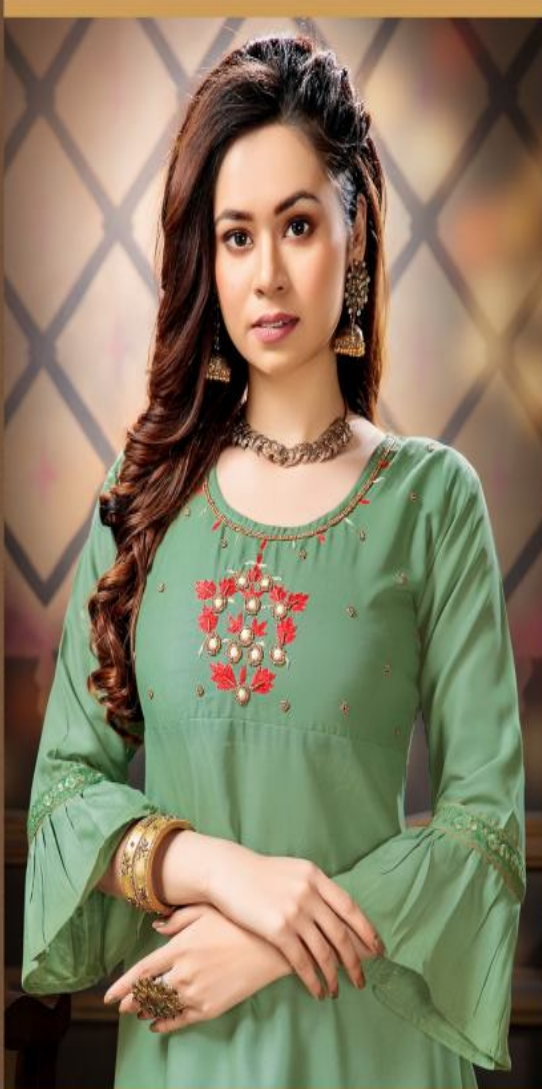
SIMPLE ELEGANCE blasting bright color is one of the most favorite fashion trends