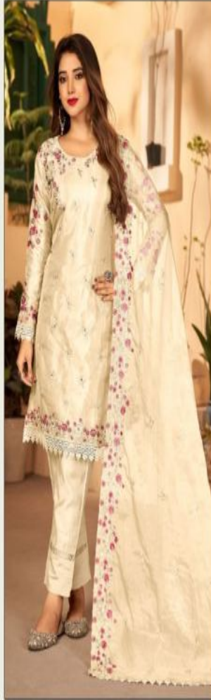
S - 162 B