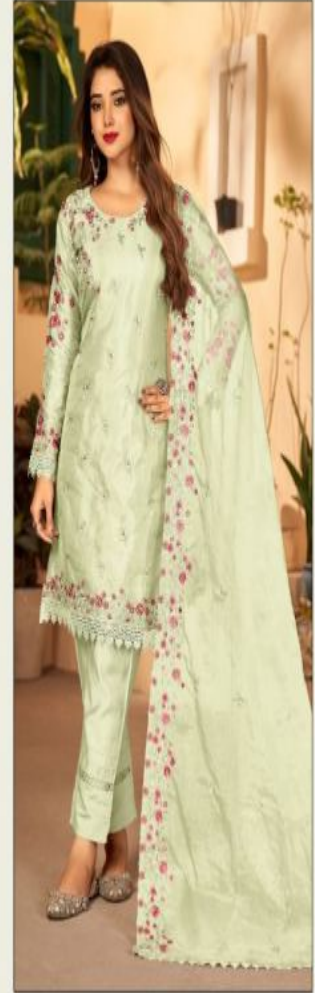
S - 162 D