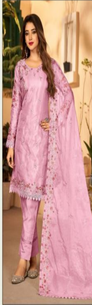
S - 162 C