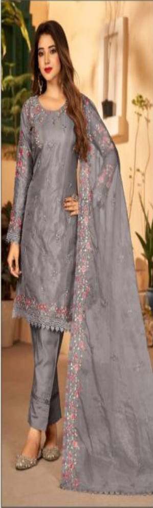
S - 162 A