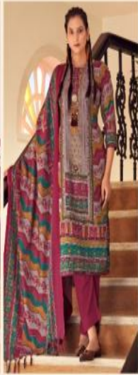
“ 855-002 ”