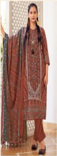
“ 855-005 ”