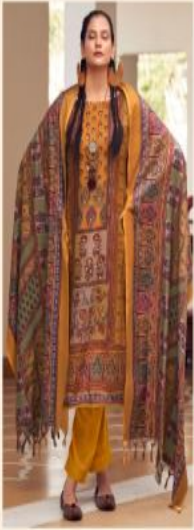
“ 855-001 ”