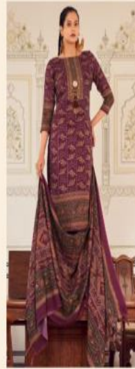
“ 855-004 ”