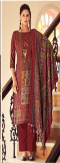
“ 855-007 ”