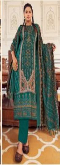
“ 855-003 ”