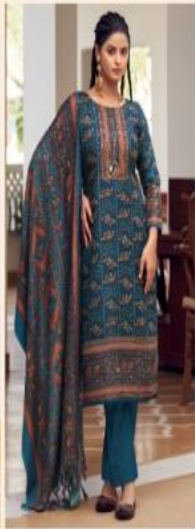
“ 855-006 ”