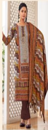
“ 855-008 ”