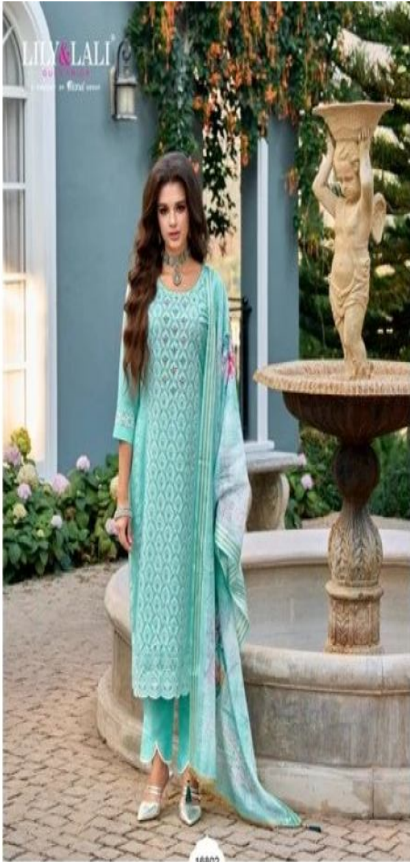
THE MODERN Exquisite