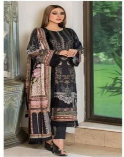
M - 46