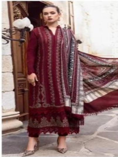
M - 45