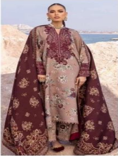
M - 41