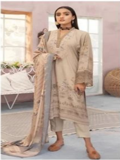
M - 44