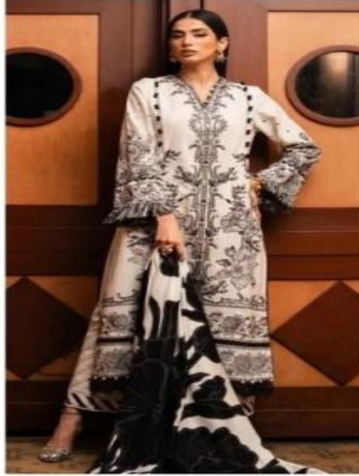
M - 42