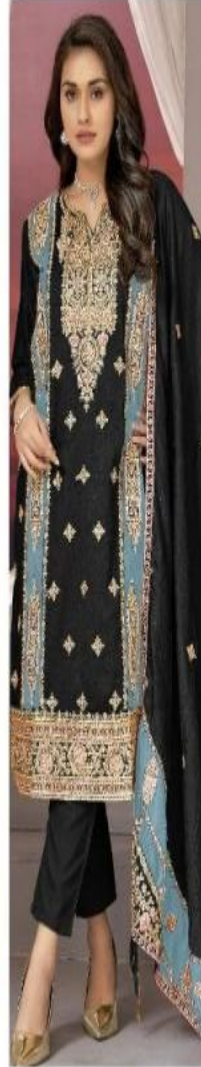
D.NO.168 - C