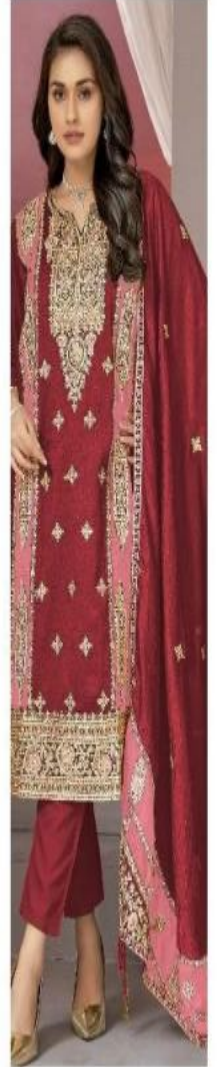
D.NO.168 - D