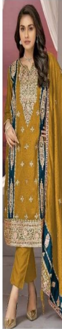
D.NO.168 - B