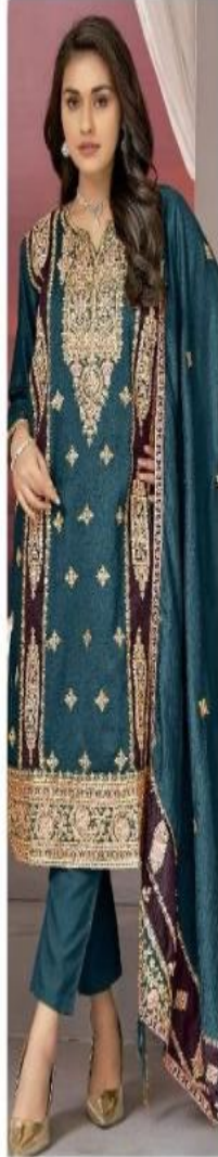
D.NO.168 - A

TOP - CHINON SILK WITH EMBROIDERY WORK WITH ZARKAN WORK BOTTOM - DULL SANTOON DUPATTA - CHINON SILK WITH EMBROIDERY INEER - DULL SANTOON