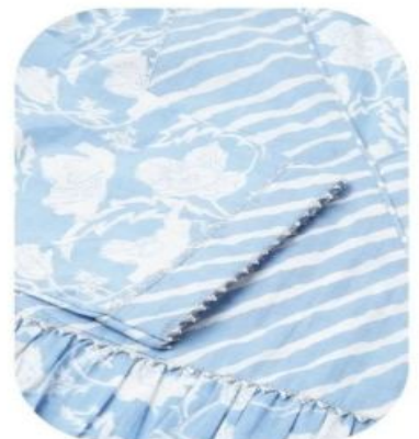
SET0090 (1 KURTI, 1 PANT) FABRIC: COTTON