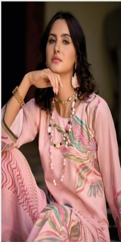
ROSHINA | 1034

PURE ELEGANCE WITH ALLURING FLORAL PATTERNS ON LACY FABRIC AND ADD SHAMOUR TO YOUR STYLE