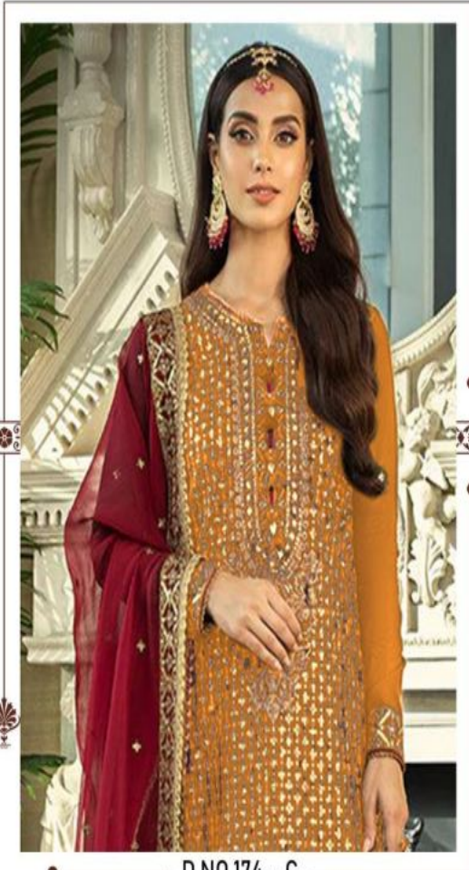
D.NO.174 - C

TOP - GEORGETTE WITH EMBROIDERY SEQUENCES WORK BOTTOM - DULL SANTOON DUPATTA - GEOGETTE WITH EMBROIDERY WORK INEER - DULL SANTOON