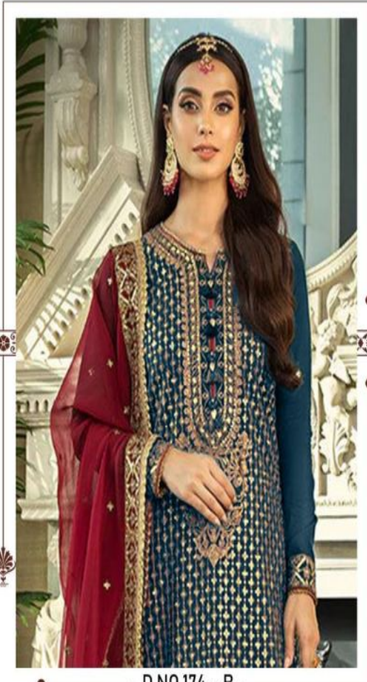
D.NO.174 - B

TOP - GEORGETTE WITH EMBROIDERY SEQUENCES WORK BOTTOM - DULL SANTOON DUPATTA - GEOGETTE WITH EMBROIDERY WORK INEER - DULL SANTOON