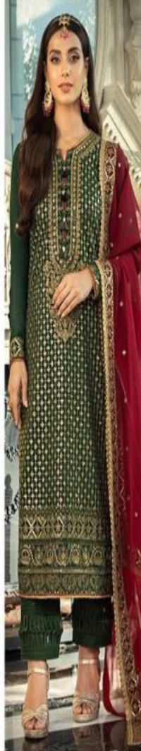
D.NO.174 - A