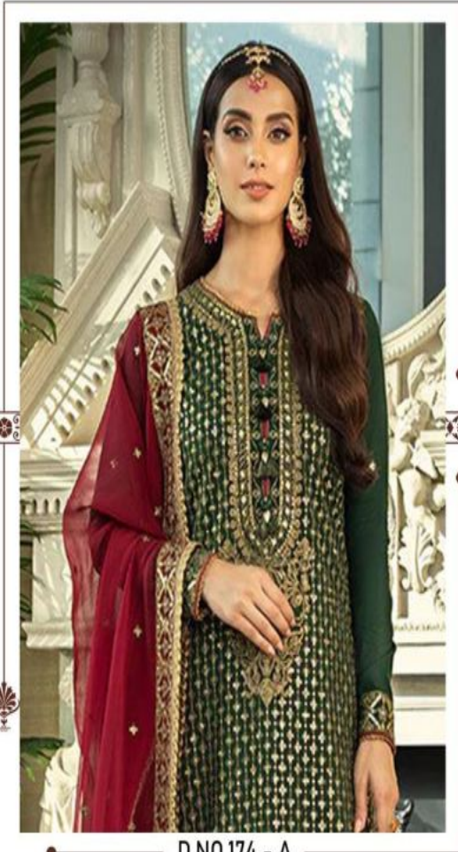
D.NO.174 - A

TOP - GEORGETTE WITH EMBROIDERY SEQUENCES WORK BOTTOM - DULL SANTOON DUPATTA - GEOGETTE WITH EMBROIDERY WORK INEER - DULL SANTOON