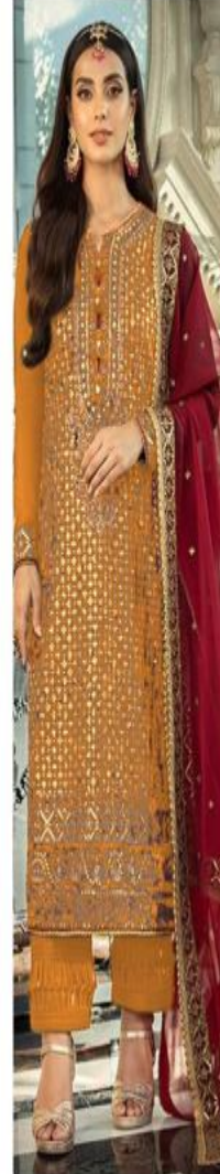
D.NO.174 - C