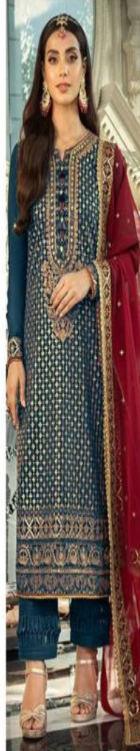
D.NO.174 - B