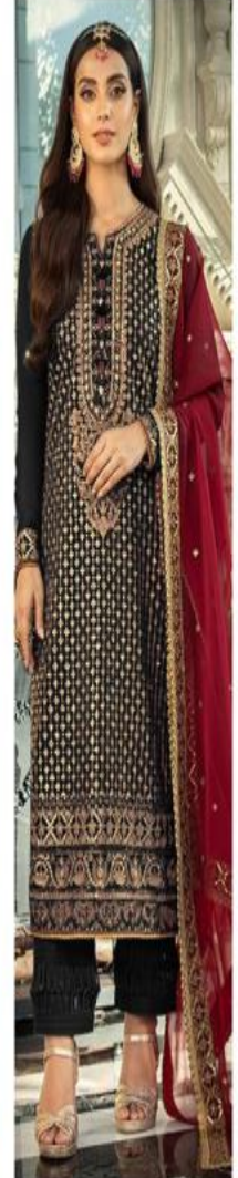
D.NO.174 - D