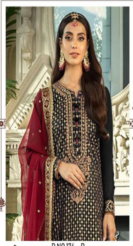
D.NO.174 - D

TOP - GEORGETTE WITH EMBROIDERY SEQUENCES WORK BOTTOM - DULL SANTOON DUPATTA - GEOGETTE WITH EMBROIDERY WORK INEER - DULL SANTOON