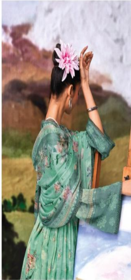
A great photograph is one that fully expresses what one feels, in the deepest sense about what is being photographed.