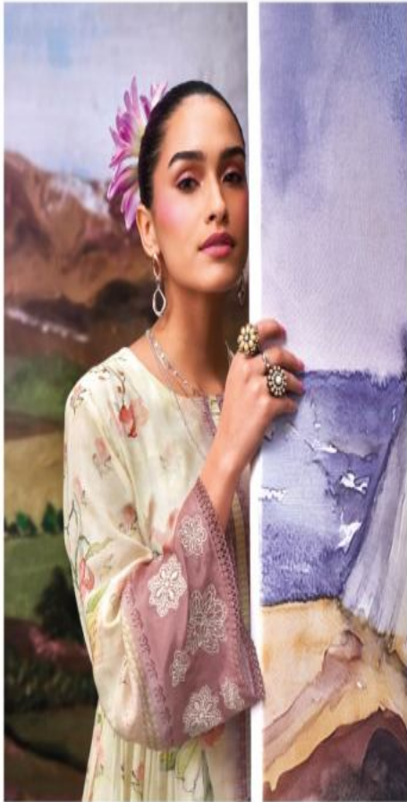
A great photograph is one that fully expresses what one feels in the deepest sense about what is being photographed.