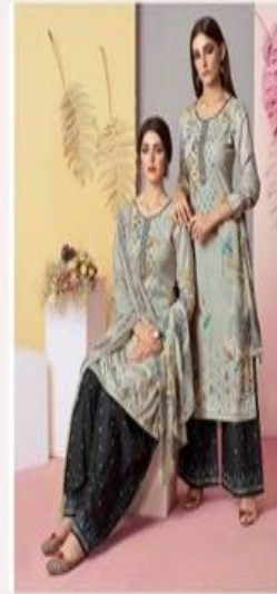
5 1 0 4