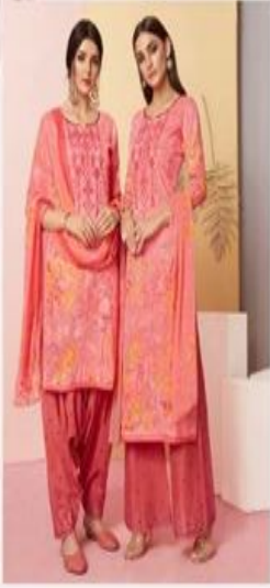
5 1 0 1