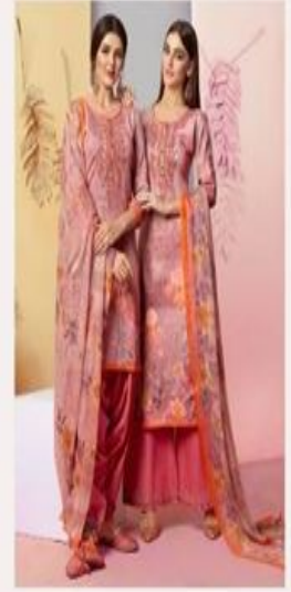
5 1 0 6