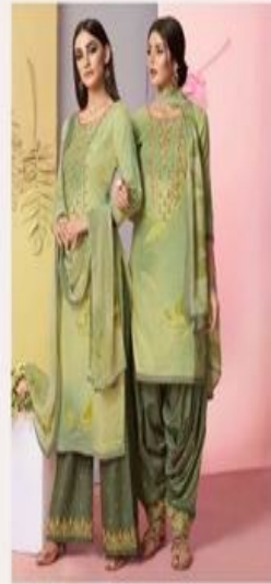
5 1 0 7