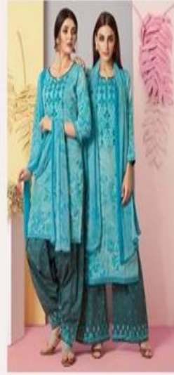
5 1 0 5