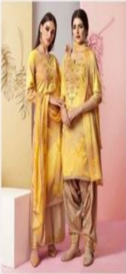
5 1 0 3