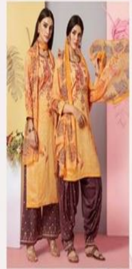
5 1 0 8