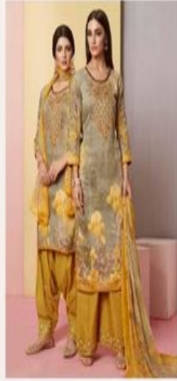
5 1 0 2