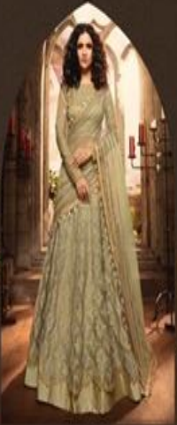
• 21005 •