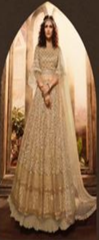
• 21003 •