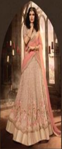
• 21002 •