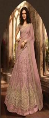
• 21004 •