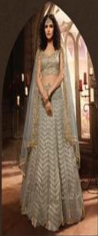
• 21001 •