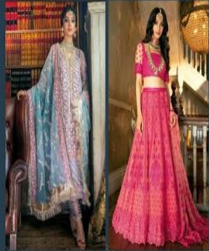
Design Number XXXIV