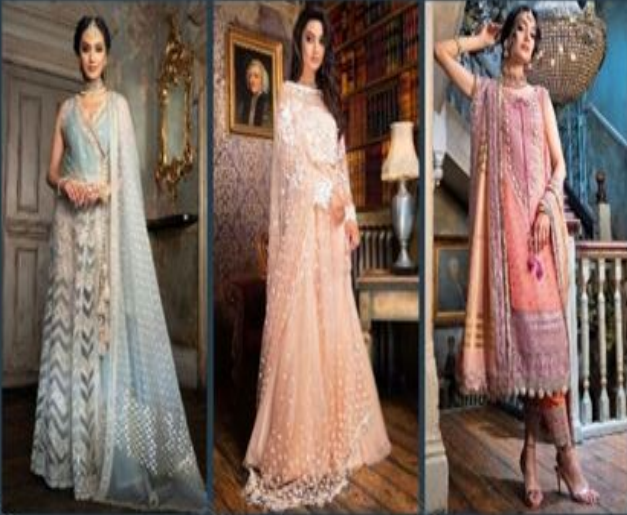
Design Number XXXI