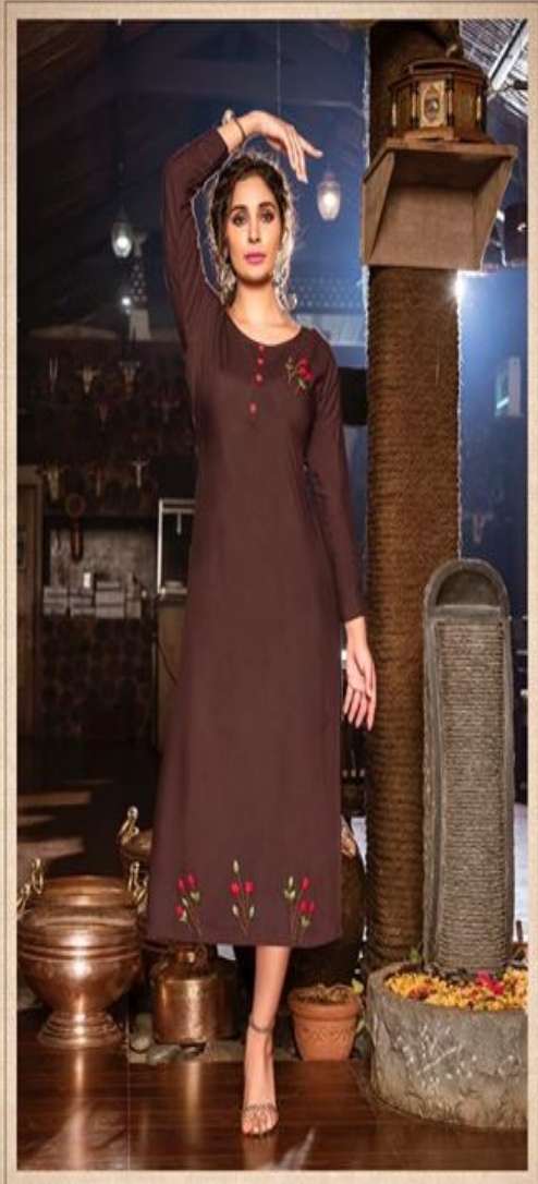
D.no - 1008